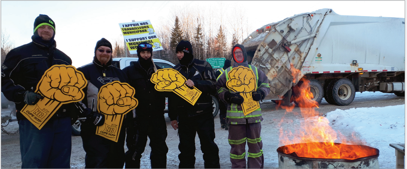
Locked-out Chaleur Regional Service Commission landfill workers, members of CUPE 4193

The federal NDP is calling for leadership that protects workers by introducing anti-scab legislation that will cover union members in federally-regulated industries. If it passes, Canada will join Quebec and British Columbia, which have anti-scab legislation for workers under provincial jurisdiction.