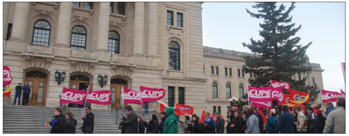
CUPE members rally in opposition to Bill 85 at the Saskatchewan Legislative Building in Regina.