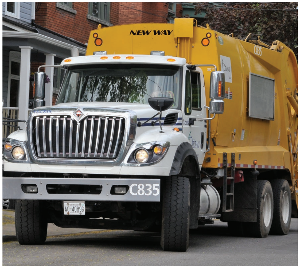
CITY OF OTTAWA WASTE DISPOSAL