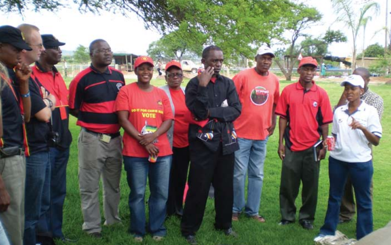
Bela Bela, South Africa

made in their countries and the Canadian government painted a rosy picture for women in this country. The CLC, and the Feminist Alliance for International Action (FAFIA), compiled an alternate report “Reality Check” that outlined the ways the struggle for women’s equality has stalled or regressed under the Harper government.