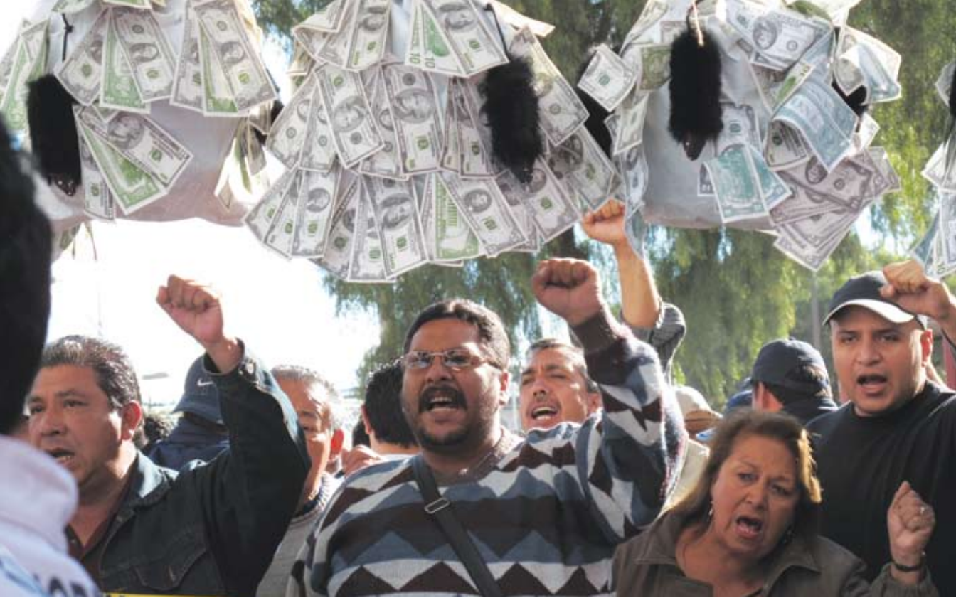
Members of the Mexican electrical workers' union protest corruption in the sale of the state utility.