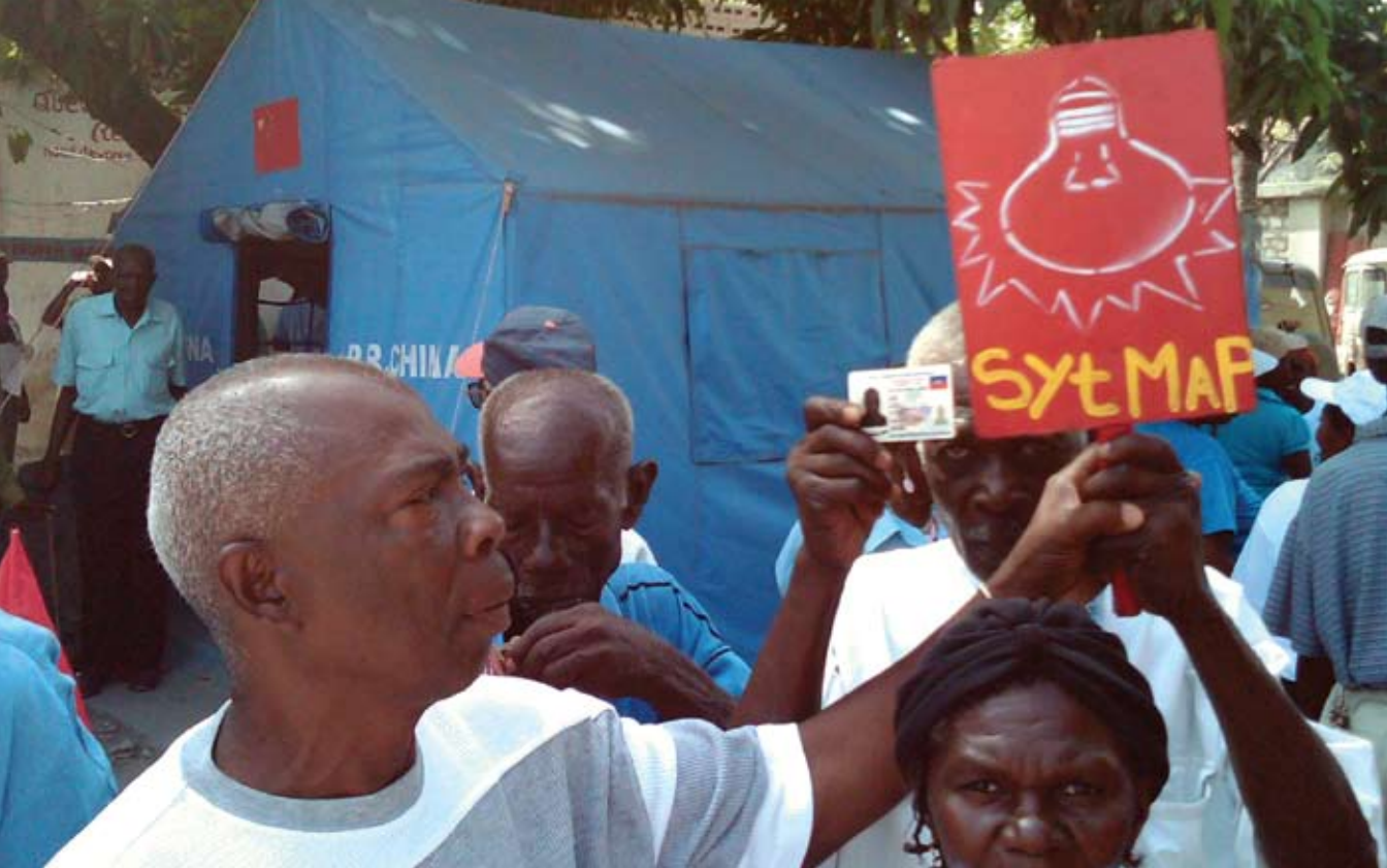
May Day rally with members of the municipal workers union of Port au Prince, Haiti.