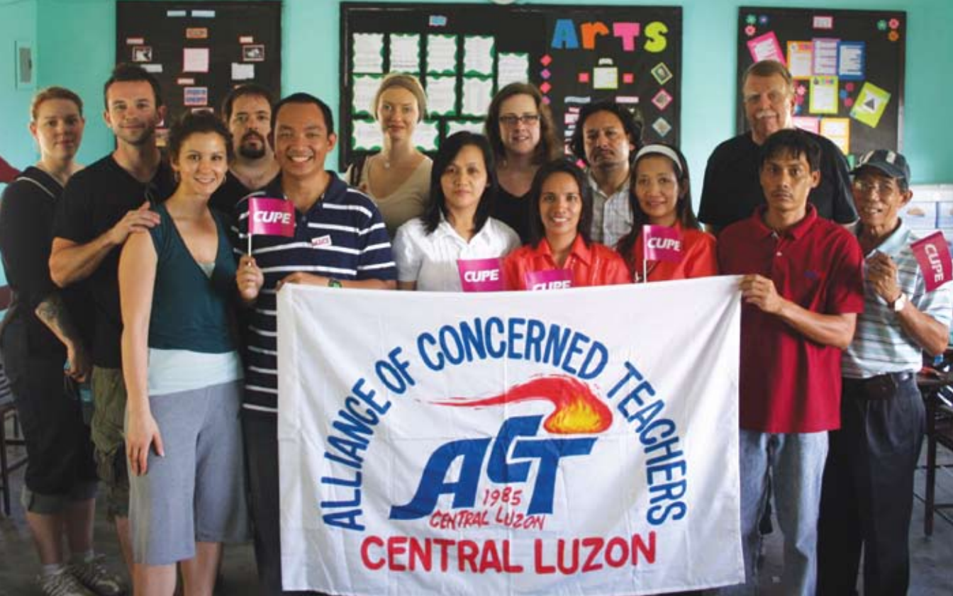
CUPE delegates visit a school where ACT is represented, Philippines.

Concerned Teachers (ACT) and the Confederation for Unity, Recognition and Advancement of Government Employees (COURAGE), CUPE 4600 and their community partner, the Ontario Committee for Human Rights in the Philippines (OCHRP), organized a tour to the Philippines in January 2010.