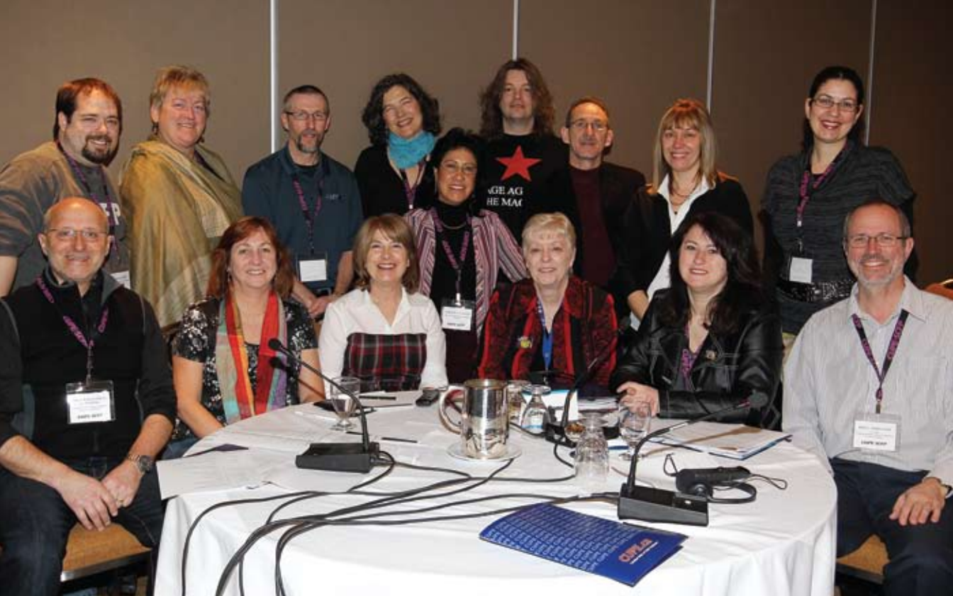
National Global Justice Committee