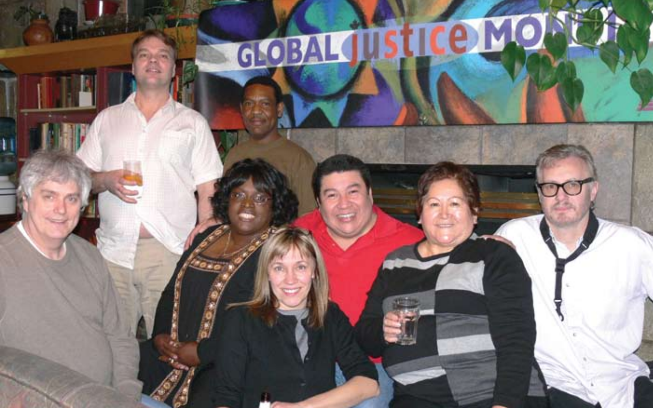
Activists in Winnipeg celebrate Nelson Mandela.