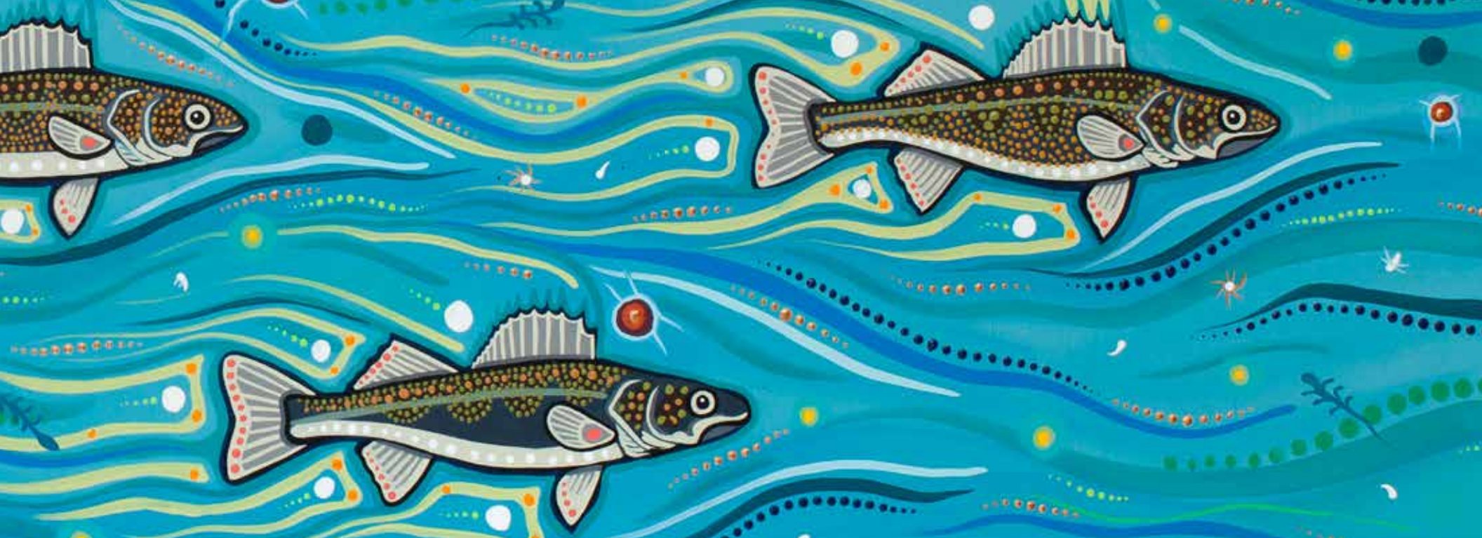
Artwork: Christi Belcourt, Métis visual artist

for on-reserve water/wastewater systems, but without providing for any new funding to help First Nations meet or maintain the new standards.