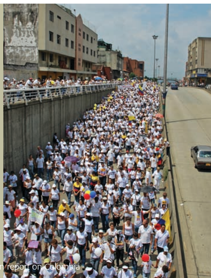
DAY 3 RIGHT: GOVERNMENT ORGANIZED MARCH AGAINST THE FARC IN CALI.

DAY 3 ABOVE: CHILDREN OF AGUA BLANCA HAVE LITTLE HOPE OF ANY EDUCATION OR FUTURE.