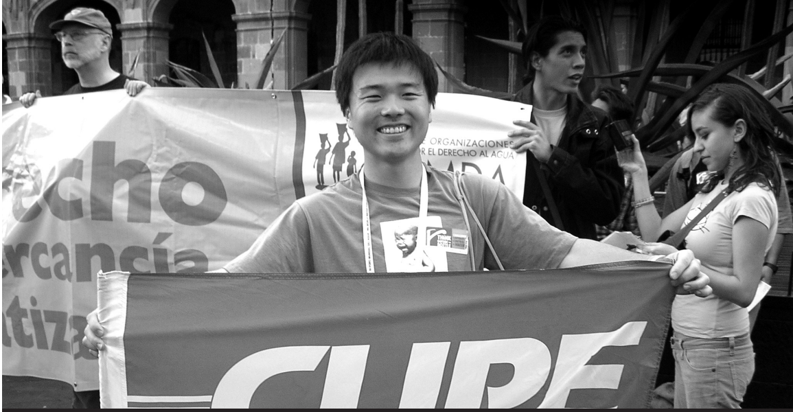
A Japanese activist poses with the CUPE banner at a World Water Day event in Mexico City, March 2006