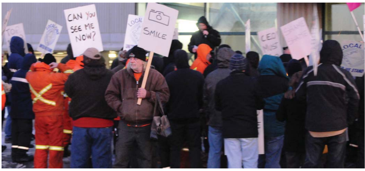
Protestors rally in the early morning hours outside Toronto Hydro, Feb. 4, 2011.