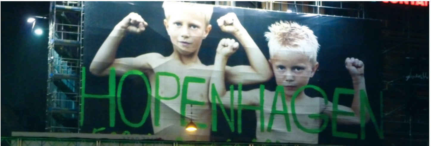
“Hopenhagen” billboard in the centre of Copenhagen