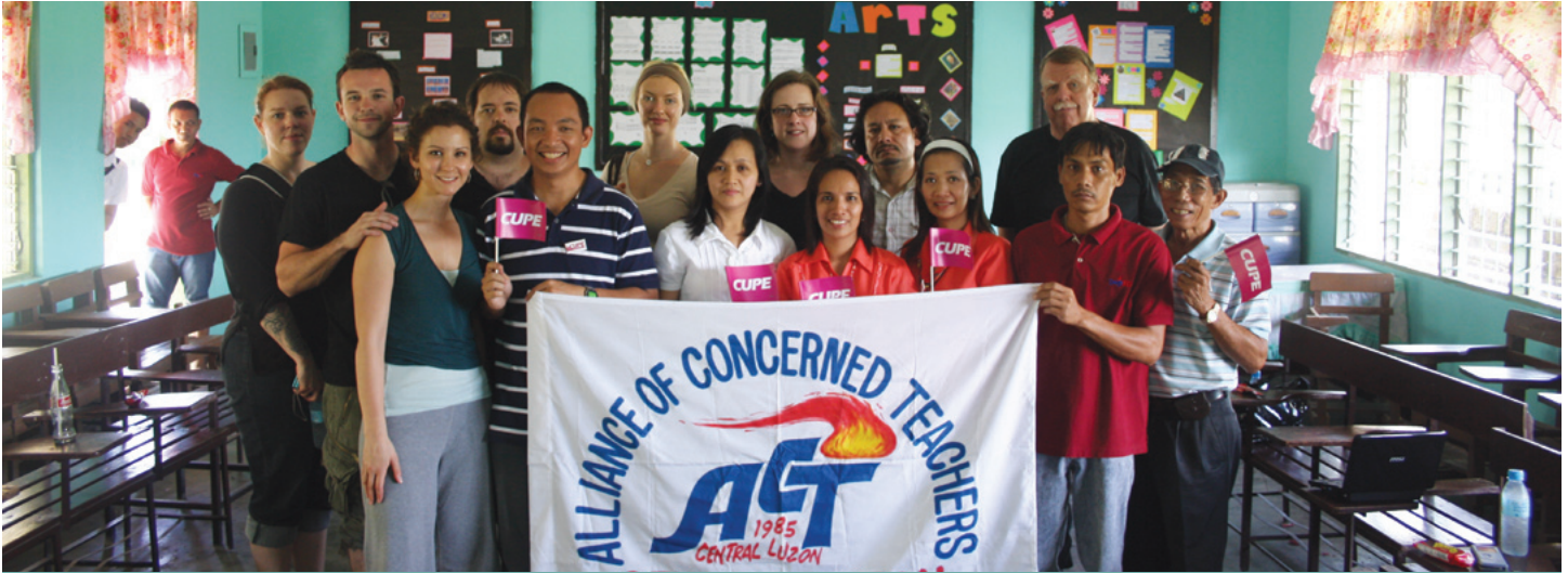
Visiting a school represented by the Alliance of Concerned Teachers (ACT). The military conducts “awareness” campaigns here advising teachers and students to stay away from organizations and unions such as ACT.