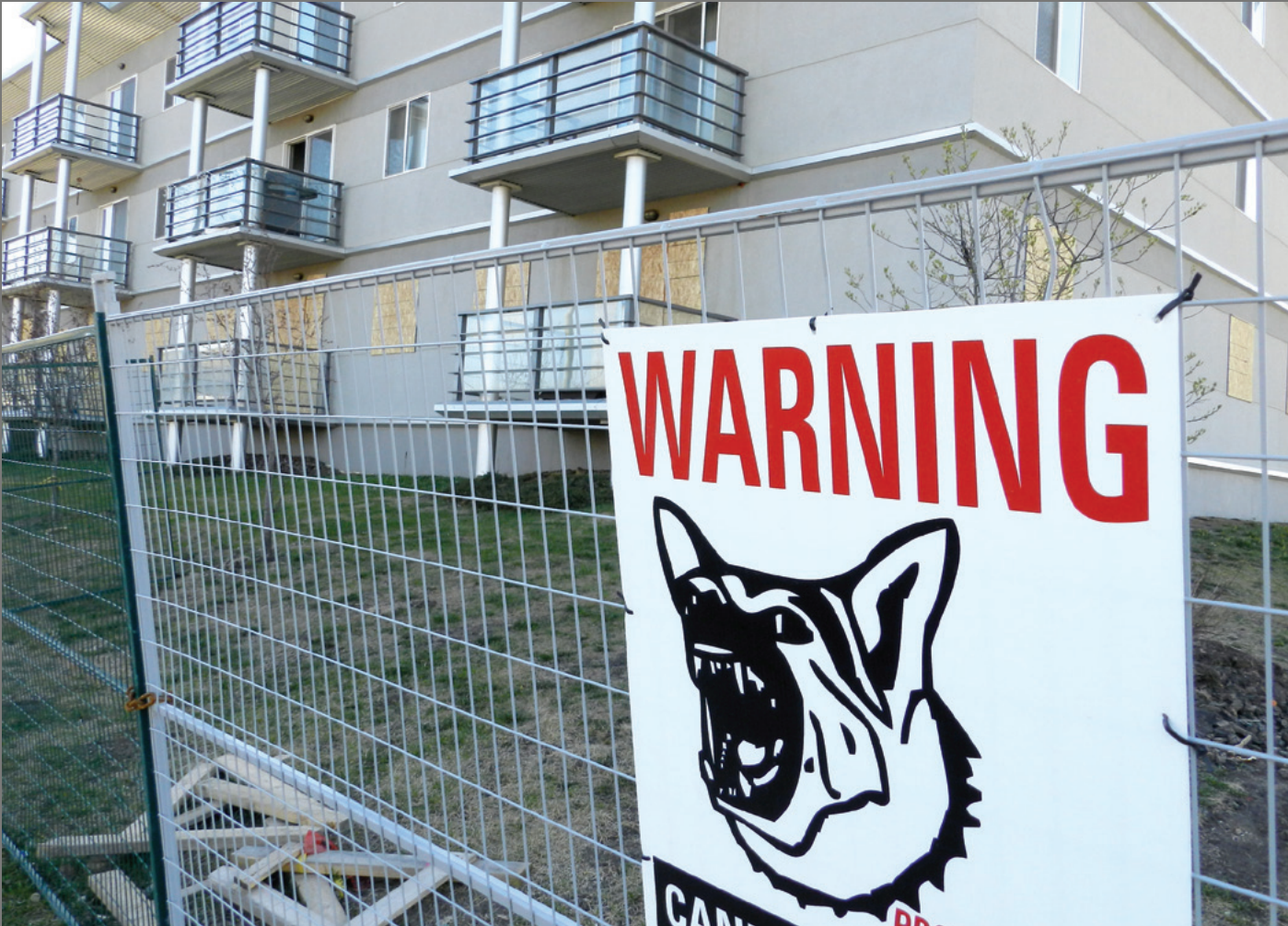
Sign in front of condemned condo buildings.