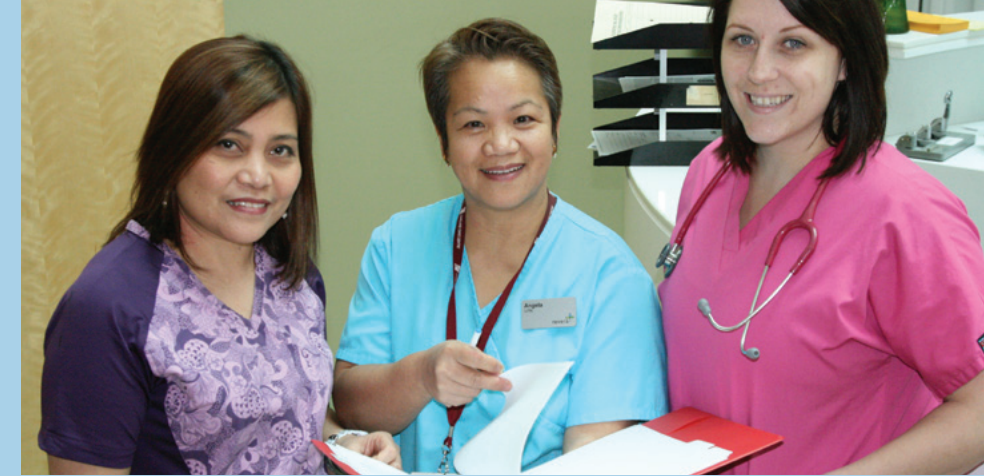
Licensed practical nurses, members of the Hospital Employees Union in British Columbia.

One of the most important issues nurses are facing is being able to use all the skills they were trained to do. LPNs/RPNs are on the front lines delivering high quality care to patients and residents in hospitals, residential long-term care facilities and home and community care settings. Our members want to serve the public and do the job