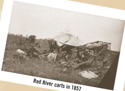
Red River carts in 1857

French tradition, to allow each settler access to the river for transportation and water for domestic use. Most Métis families only grew small gardens and feed for livestock while buffalo were still plentiful.