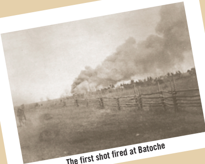
The first shot fired at Batoche