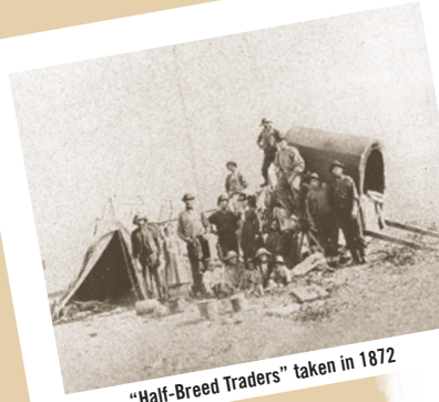
“Half-Breed Traders” taken in 1872

At this time the French-speaking Métis began to develop their economic independence. They began trading with St. Paul in the United States, which was impinging on the HBC’s trade and profit. In 1844, only 6 carts of furs were traded by Métis with St. Paul, but by 1869, the trade had grown to 2,500 carts delivering furs to the US. xvii Author Don Maclean writes that the years 1850 to 1870 were the high point of the Métis