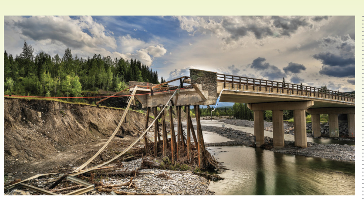
Bridge on the highway to Elbow Falls, Alberta wiped out by rushing flood waters making their way to High River and Calgary in June 2013.