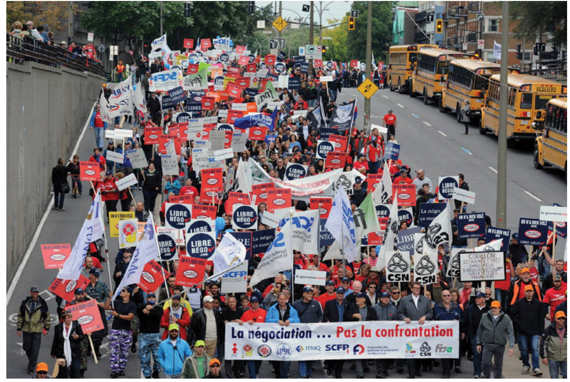
Some of the more than 35,000 people who protested a Liberal government bill that would re-open signed contracts.