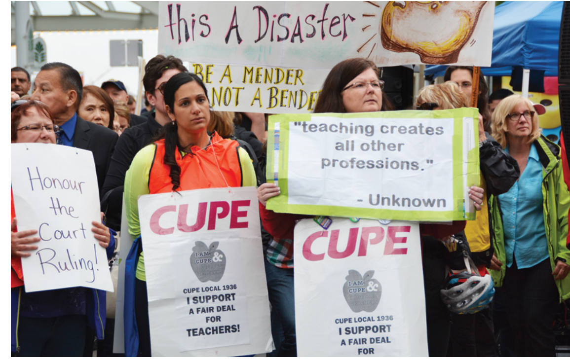
CUPE members join striking BC Federation of Teachers' Federation members.