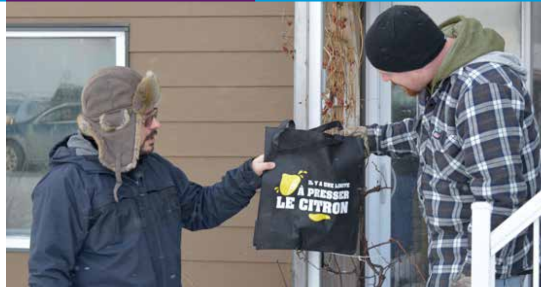
↑ CUPE locals representing call centre workers in Quebec distributed educational kits to all members to raise awareness about psychological distress on the job. The campaign slogan is "Pressure has its limits" ( Il y a une limite à presser le citron ).

We're also equipping our members with the tools to advocate for a fair economy. Over breakfast at division conventions, and through a series of online videos on popular economics, we are sparking conversations with our members about how the economy can work for Canadian