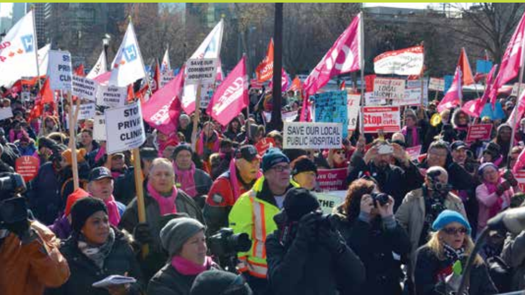
↑ More than 3,000 people, including many CUPE members, rallied at the Ontario legislature on November 21 to stop the Liberal government's cuts to health care, privatization and systematic dismantling of community hospitals. The protest was organized by the Ontario Health Coalition.