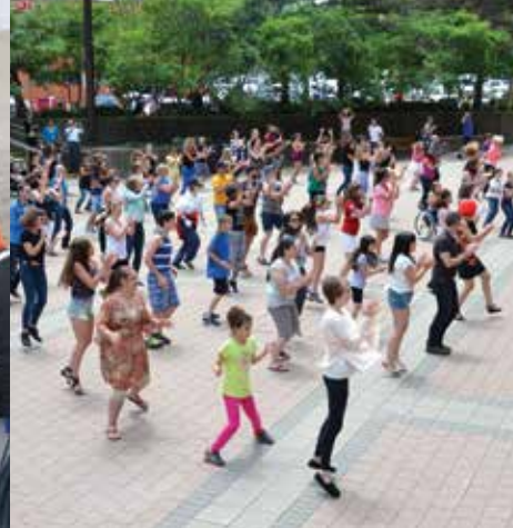
← Flight attendants are using many tactics to highlight the danger to passenger safety of changing the rule requiring one flight attendant for every 40 passengers, including a creative flash mob outside Transport Canada's Toronto offices.

The day also marked the launch of our campaign for a renewed Accord, organized in coalition with the Council of Canadians. Local supporters went door-to-door and organized major public events in a highly visible campaign that brought our message to 12 communities in eight provinces.