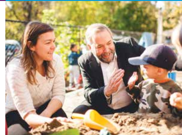
↑ NDP Leader Tom Mulcair at an Ottawa child care centre staffed by CUPE members. The federal NDP's commitment to deliver a national child care program based on the successful Quebec model, as well as their proposal for a $15 federal minimum wage, are helping shape the political landscape for the 2015 federal election.

In British Columbia, CUPE and HEU members were out in full force as candidates and campaigners in their elections – with impressive results. Two-thirds of labour-endorsed candidates were elected, including more than 200 CUPE-endorsed candidates. Progressive governments were re-elected in every region. And candidates campaigning for better public services and