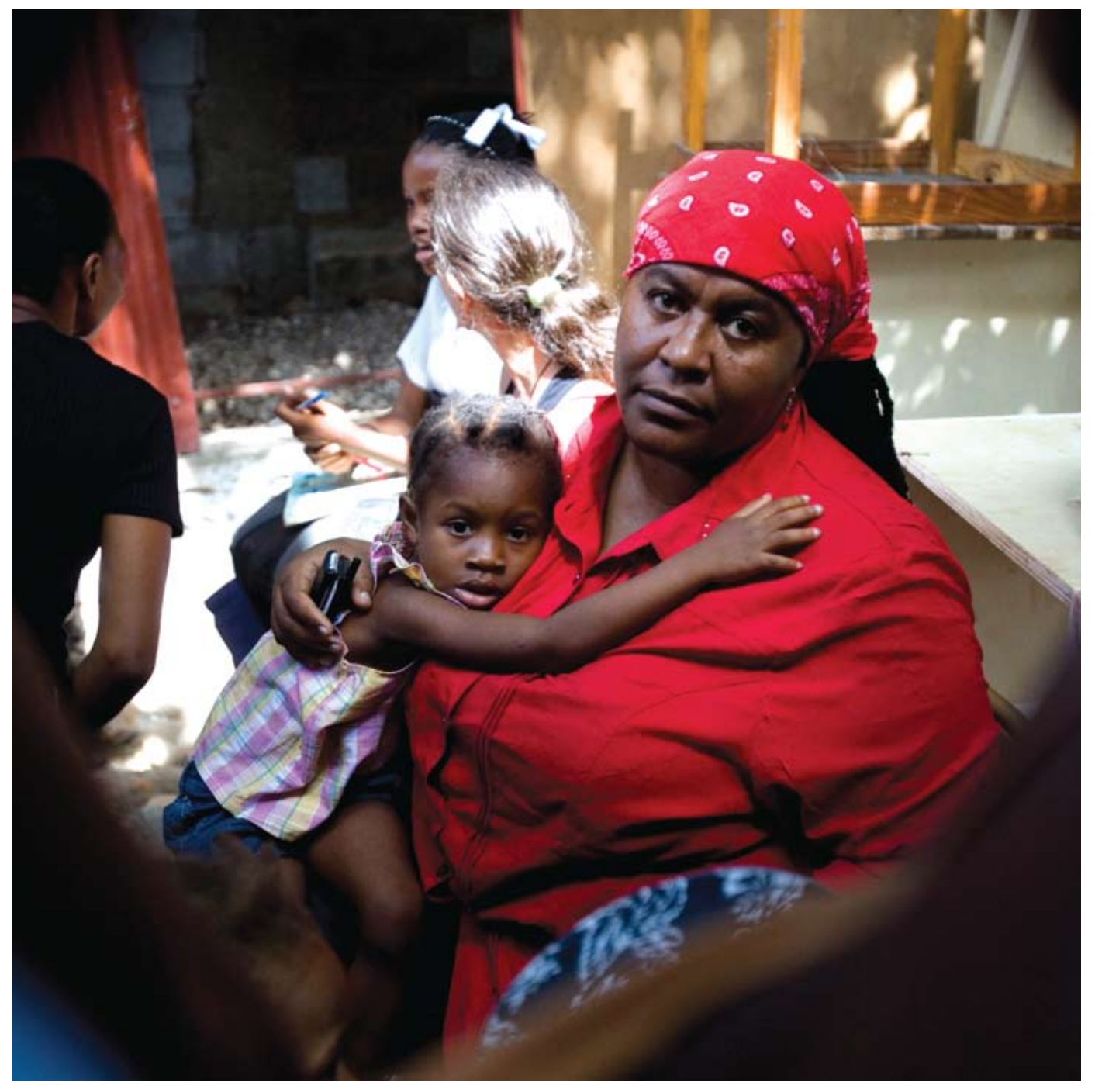
CUPE is working with the Confederation of Public and Private Sector Workers (CTSP), an affiliate of the Public Services International (PSI), to provide solidarity and support to the people of Haiti.