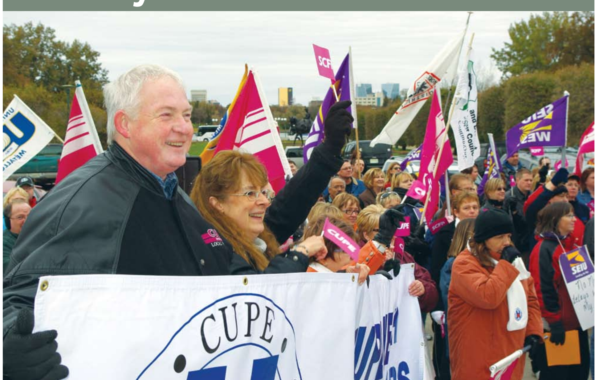
Saskatchewan's 25,000 health care providers have been without new collective agreements for more than two years. Thousands of health care workers came out to protest at the legislature.