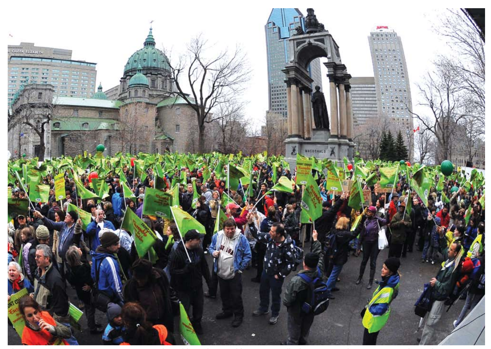
The Common Front, representing unions in the public and parapublic sectors, rallied 75,000 people to support its demands in a massive demonstration in downtown Montreal.

organizing, speaking out and making progress.