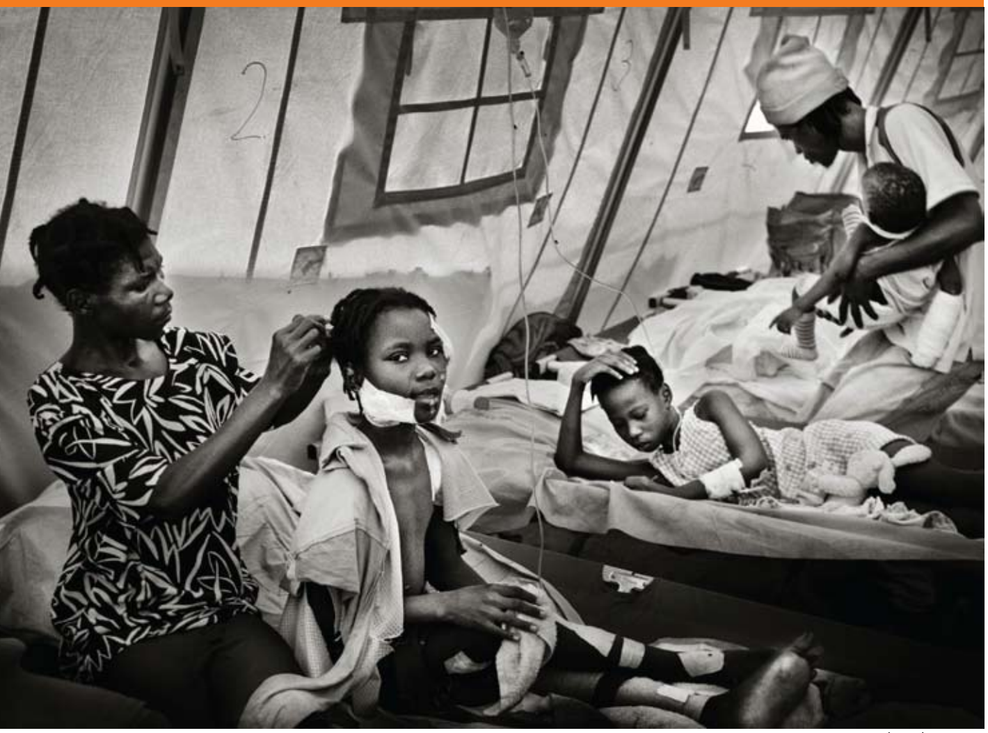
Lung Liu lungliu.com

Children recover from injuries at the Port-au-Prince General Hospital following the January 12, 2010 earthquake. The Red Cross estimates that more than 3 million people were affected by the quake.