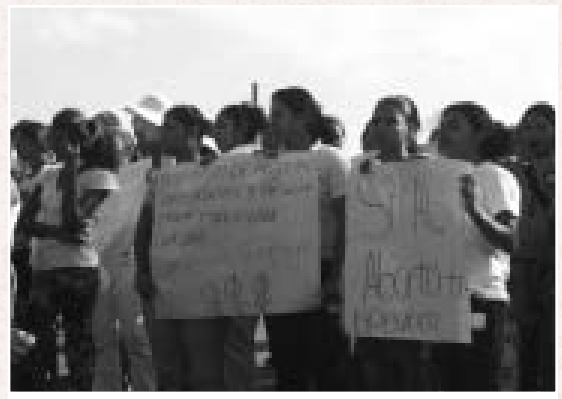
An International Women's Day abortion rally at the Nicaraguan Supreme Court in Managua on March 8, 2007.

Canada is part of the Inter-Americas Regional Executive Committee (IAMREC) of PSI, which covers North, Central and South America and provides a network for inter-union activity and support across the hemisphere. The head of the Canadian component of IAMREC sits on the Executive Committee. This position rotates among Canadian affiliates. After the PSI