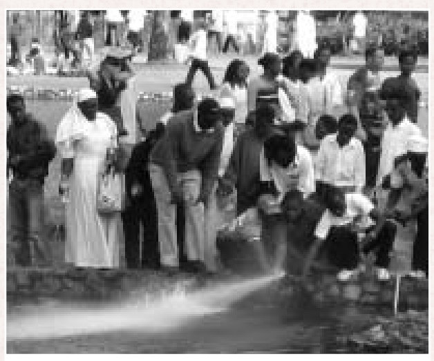
People filling their bottles with contaminated water from an urban duck pond at Uhuru Park, Nairobi, Kenya.

At the World Social Forum 2007, in Nairobi, Kenya, CUPE members and staff heard about the lack of access to clean water in poor communities because