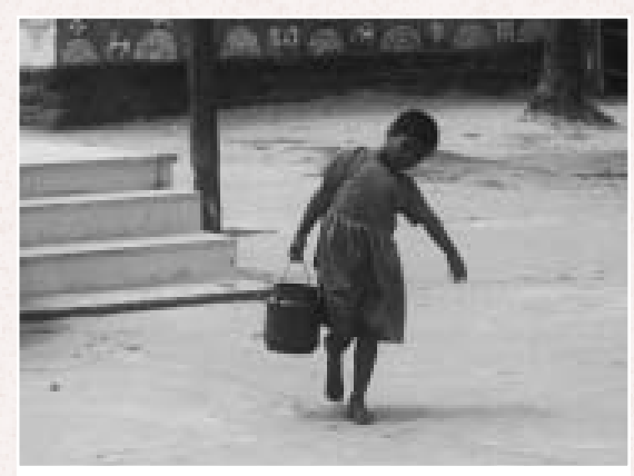
Girl collecting water in Raghurajppur, Orissa, India.

contamination and community-based solutions. Some water bottlers earn huge profits from bottling publicly treated water, or depleting local fresh water sources. Front and centre were concerns about American corporate interest in Canadian water and plans for bulk water exports and other forms of diversion.