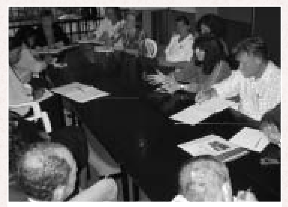
Canada-Colombia Frontline Solidarity Tour participants met with officials from the United Workers' Central (CUT) at the Women Worker's House (Casa de la Mujer Trabajadora) in Bogota, Colombia.

Through our international activities and affiliations, participation in educational programs and conferences, and through CUPE's National