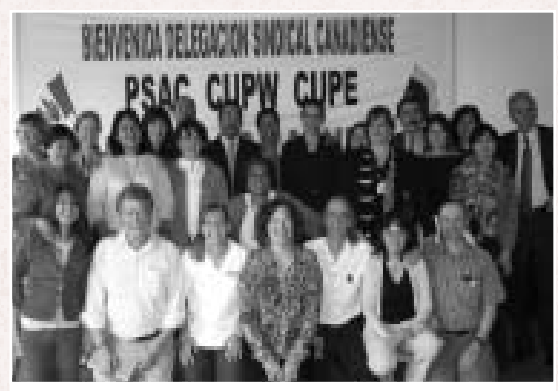
Participants in the Canada-Colombia Frontlines tour, with members of the Association of Public Employees of the Human Rights Ombudsman (ASDEP), in Bogota, Colombia

lost their jobs and services have become harder to access. More government-provided public services are slated for sale to private, frequently foreign-owned, companies.