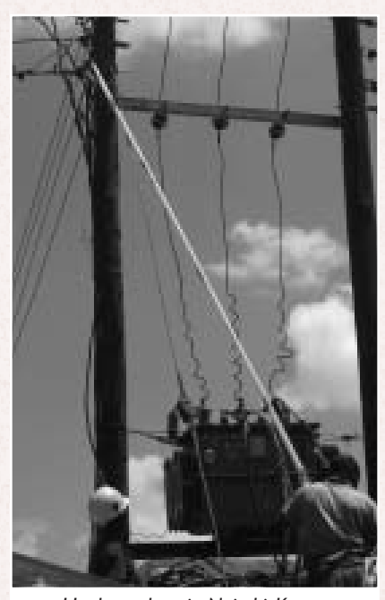
Hyrdo workers in Nairobi, Kenya.

CUPE is on the front lines locally and globally. We have a reputation for defending the rights of workers and building strong communities across Canada. We are also building a reputation internationally. International work in CUPE is not done out of charity. We are motivated by the principle of solidarity, recognizing that, as a Canadian union, we are part of the same fight as that of our brothers and sisters who are struggling against corporate control in every region of the world. Whether we work in a community in Cape Town or Corner Brook, we have a right to decent work and access to public services.