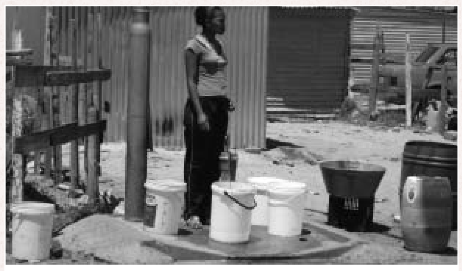
Gathering water in Cape Town, South Africa.

of privatization, and the successful delivery of publicly controlled water to people who need it. "The African Water Network" was launched in Nairobi, building on a growing movement to defend public water from privatization. Other networks that are up and running include "Red Vida" in Latin America, an International Friends of the Right to Water Network, and an informal Canadian network of water activists. CUPE has links with each of these alliances.