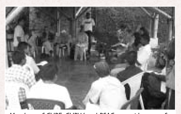
Members of CUPE, CUPW and PSAC met with some of the 5,000 campesinos (farmers) in Suarez, Colombia, who had lost their land and livelihood because of the Salvajina hydro-electric dam.

Colombian workers shared their experiences with Canadian workers about the privatization of postal and health systems, municipal services, banks and universities. Thousands of workers have